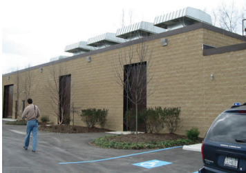
From small 55 kW to more than 10 megawatt projects, LFG Tech can supply them all.